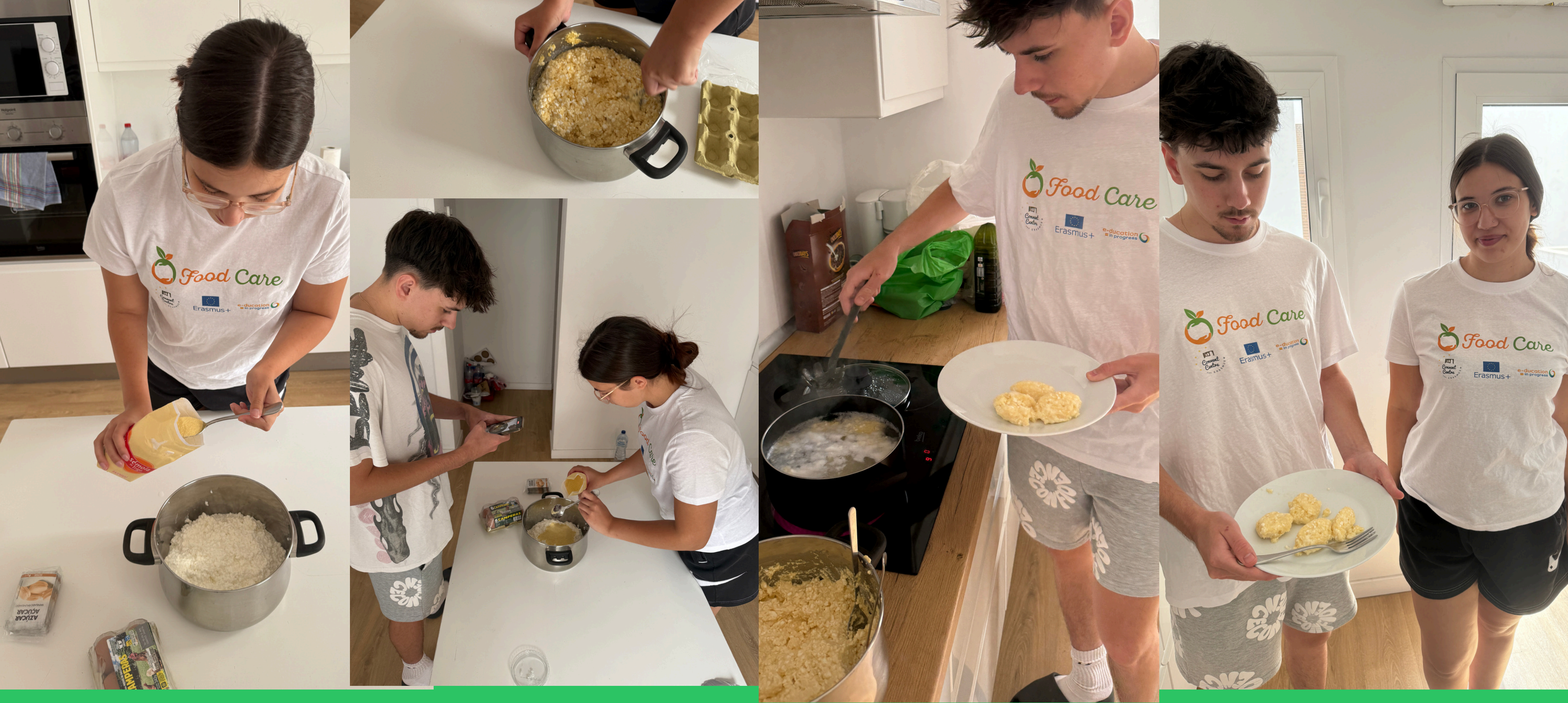
Part 4: Creation of the videos on FOODCARE “Traditional Food to support Cultural Heritage” 8th September 2025